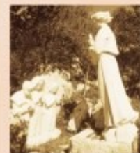
Shrine of the Fatima Children receiving Communion from the Angel at the Loca do Cabeco.

He then prostrated himself again, repeated the prayer three times to the Most Holy Trinity, and disappeared.