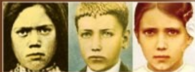
The three shepherd children of Fatima (from left): Lucia dos Santos and her cousins Francisco and Jacinta Marto, brother and sister.

A t a time when Europe was at war, three shepherd children of Fatima — Lucia dos Santos and her two cousins, Francisco and Jacinta Marto — were visited three times by the Angel of Peace. He came as Precursor to instruct and prepare them to receive and understand the great message of the Queen of Heaven, which they were soon to live and transmit.